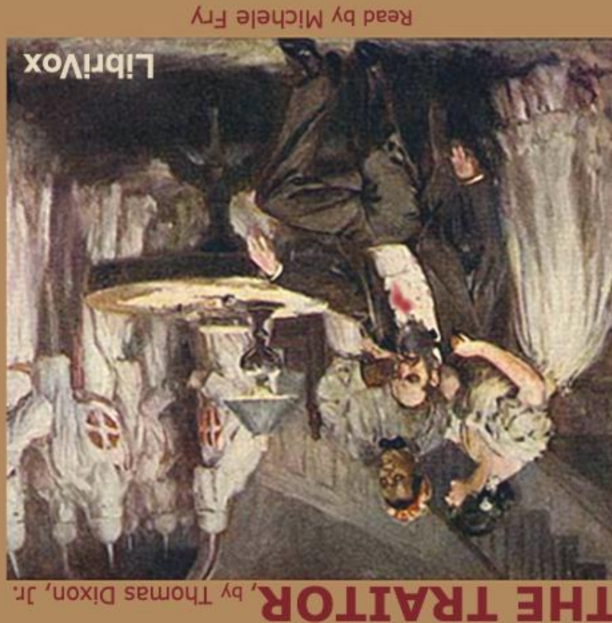
Cover image from 1st edition, published 1907 Cover design for Librivox by Michele Fry

NOTE: Easy Folding Instructions for this Origami CD case, including step by step photos, can be found here . Can also access from the LV Wiki page, CD Covers.